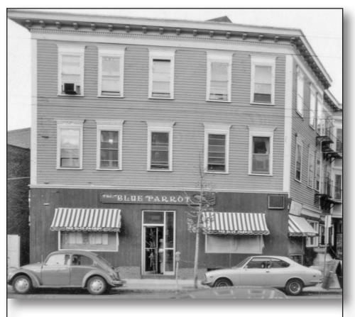
Blue Parrot.