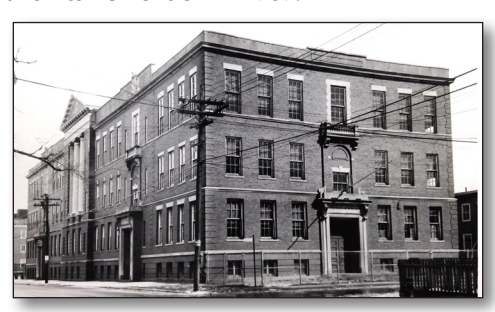
Wellington School.

In 1884, the Wellington Training school opened on Columbia Street. Initially founded to train teachers, the school was expanded in 1892 and rebuilt between 1906 and 1908. In 1916 teacher training was ended and the school operated as a public grammar school until its demolition in 1967.